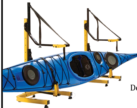
Deluxe 2-Boat Rack

FOR TECHNICAL ASSISTANCE OR REPLACEMENT PARTS: CALL 866.787.7369